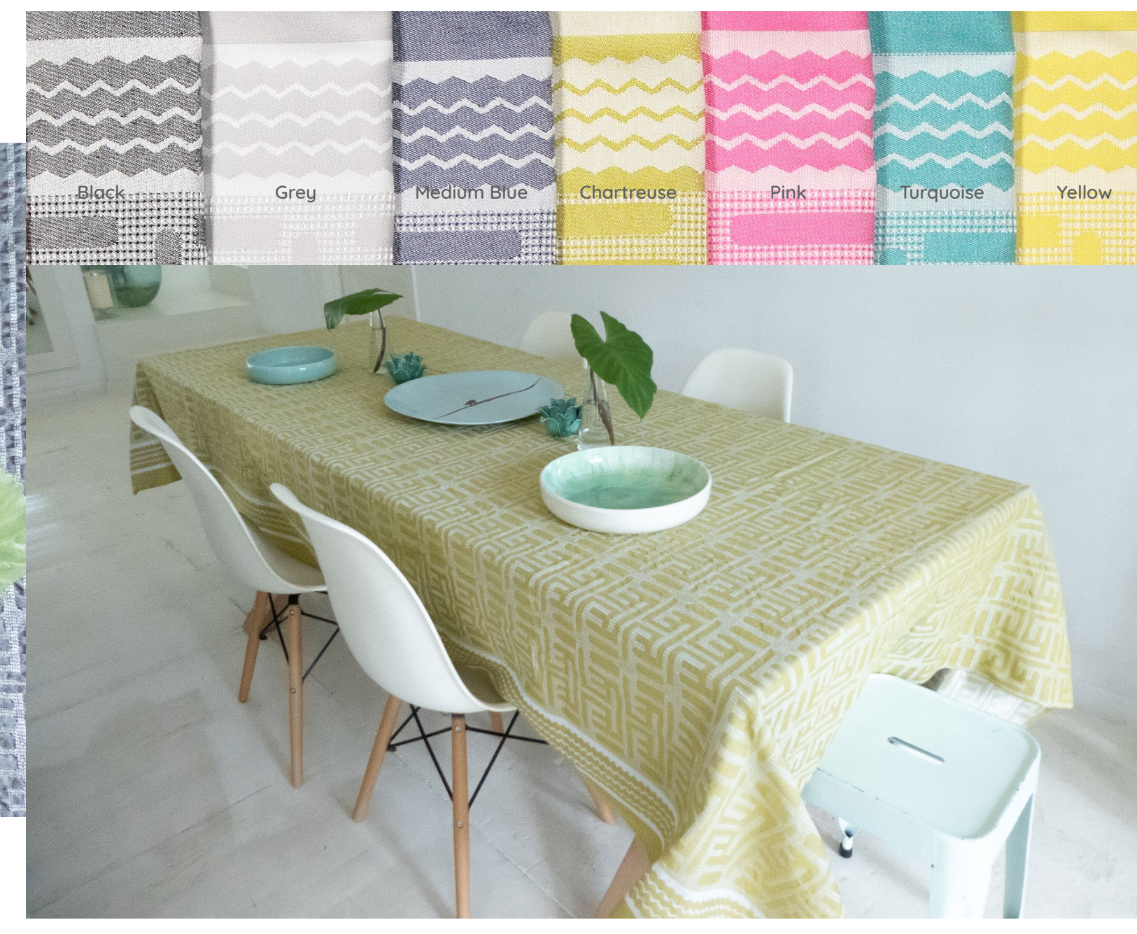
Kuba Waffle Chartreuse Throw/ Tablecloth 250cm x 165cm AJFI-007875 Pre-shrunk - Washable up to 60°, Tumbledryer recommended

Turquoise 250 x 165cm AJFI-008894 Yellow 250 x 165cm AJFI-007716