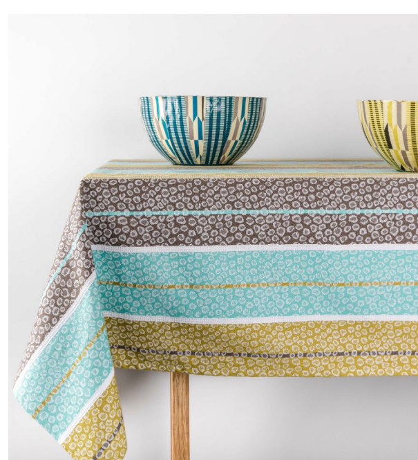
* Traditional French Stripes (made by Moutet Tissage)