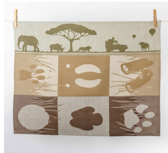
Spoor Tea Towel 46 x 66cm Brown AJFI-001295