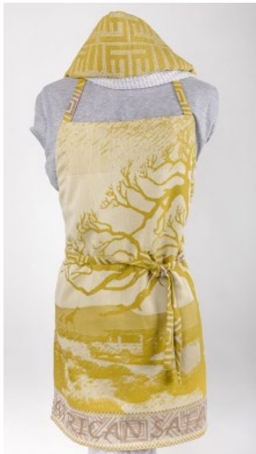
African Safari Full Apron Chartreuse 50 x 70cm AJFI-001240