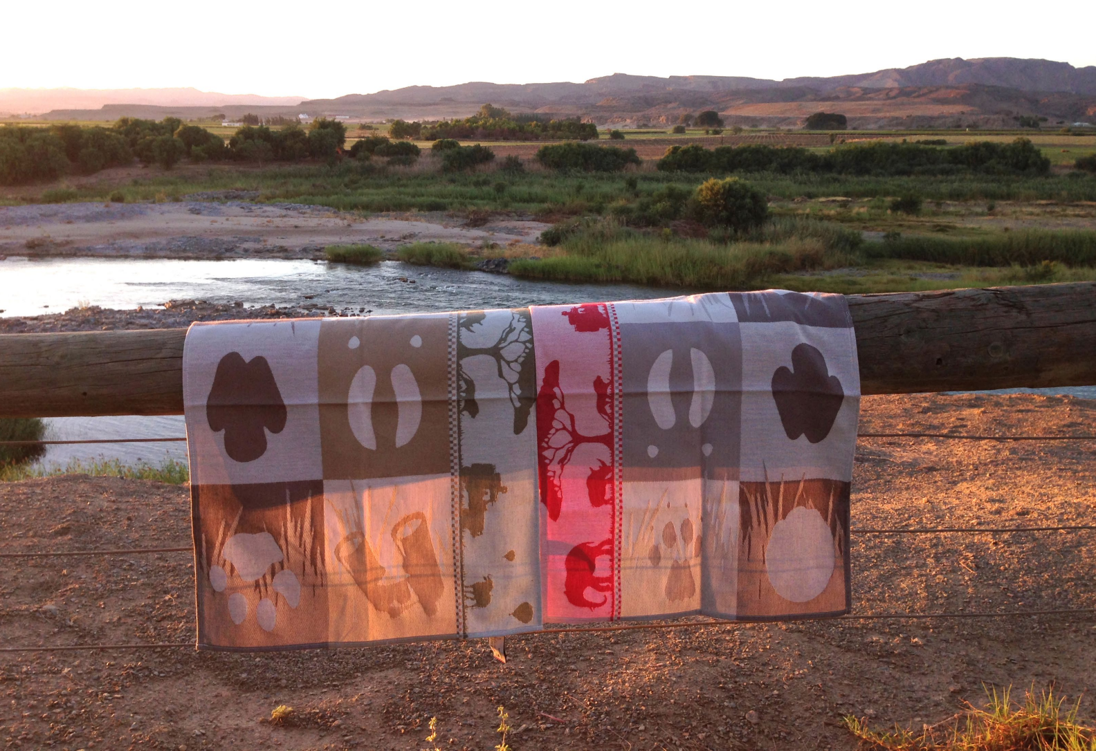
On the banks of the Orange River, on Namibian side.

African Jacquard has created a full range of kitchen linen to take back as Souvenirs from a Safari in the bush.