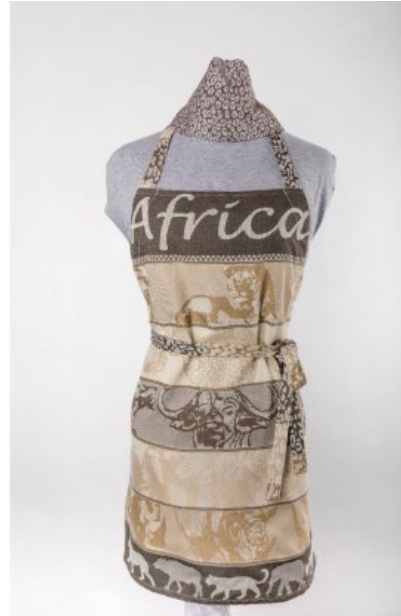
Africa Full Apron Black 53 x 70 cm AJFI-001238