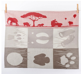
Spoor Tea Towel 46 x 66 cm Red AJFI-001294