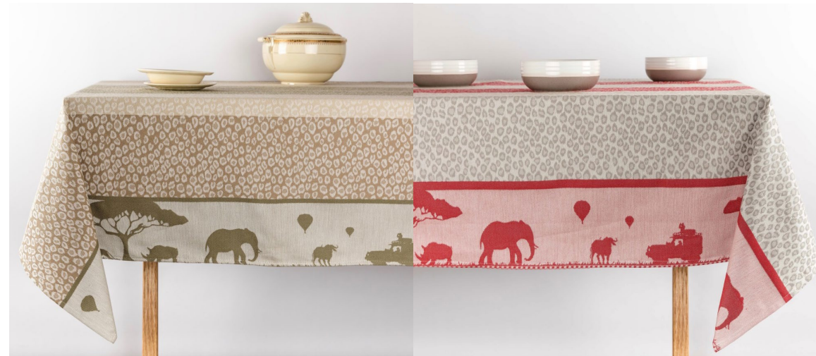
Spoor & Leopard Tablecloth Beige/Camel/Khaki/Green 146 x 134 AJFI-001000