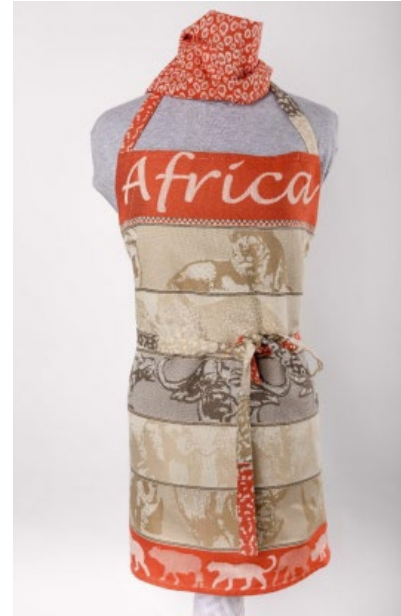
Africa Full Apron Burnt Orange 53 x 70 cm AJFI-001239