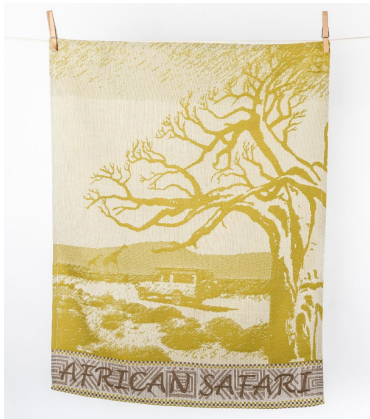
African Safari Tea Towel Chartreuse 50 x 70 AJFI-001083