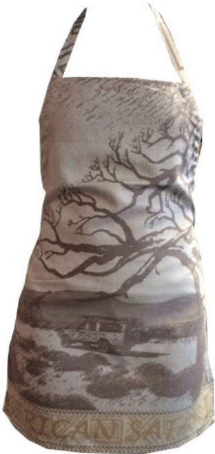
African Safari Full Apron Brown 50 x 70cm AJFI-001241