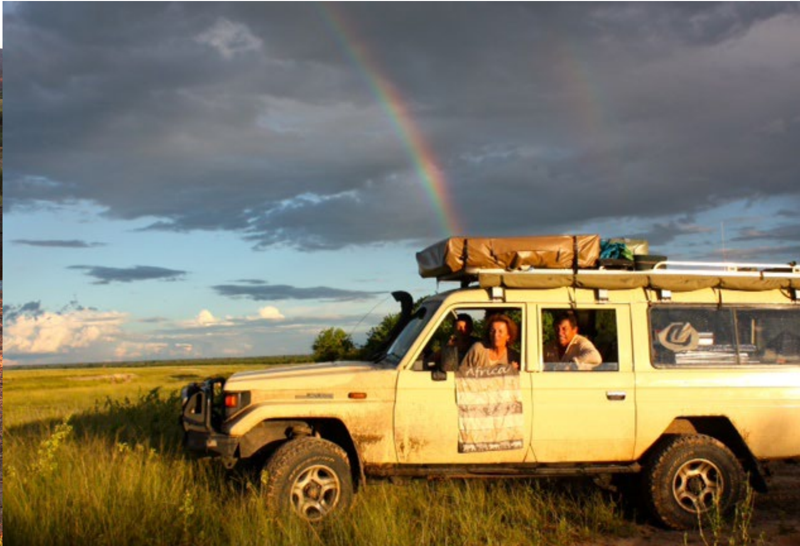
North of Botswana, Ihaha Camp, facing Caprivi Straight.