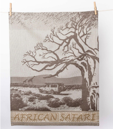
African Safari Tea Towel Brown 50 x 70cm AJFI-001082