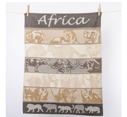
Africa Tea Towel Black 50 x 70 cm AJFI-001086